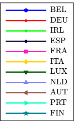
Long-Term Interest Rates